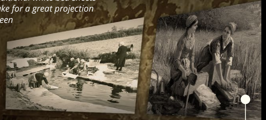
Visual media may include photographs, paintings and 3 dimensional objects such as washing boards

Small speakers are hidden in locations that promote the natural echo effect of the building.