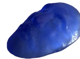
Examples of similar objects from Marina's portfolio