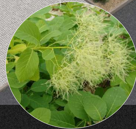
Cotinus coggygia (Wig tree)