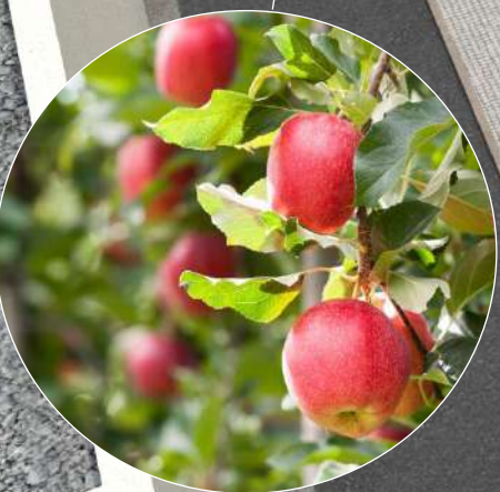
Fruit tree (apple tree, pear tree etc.)