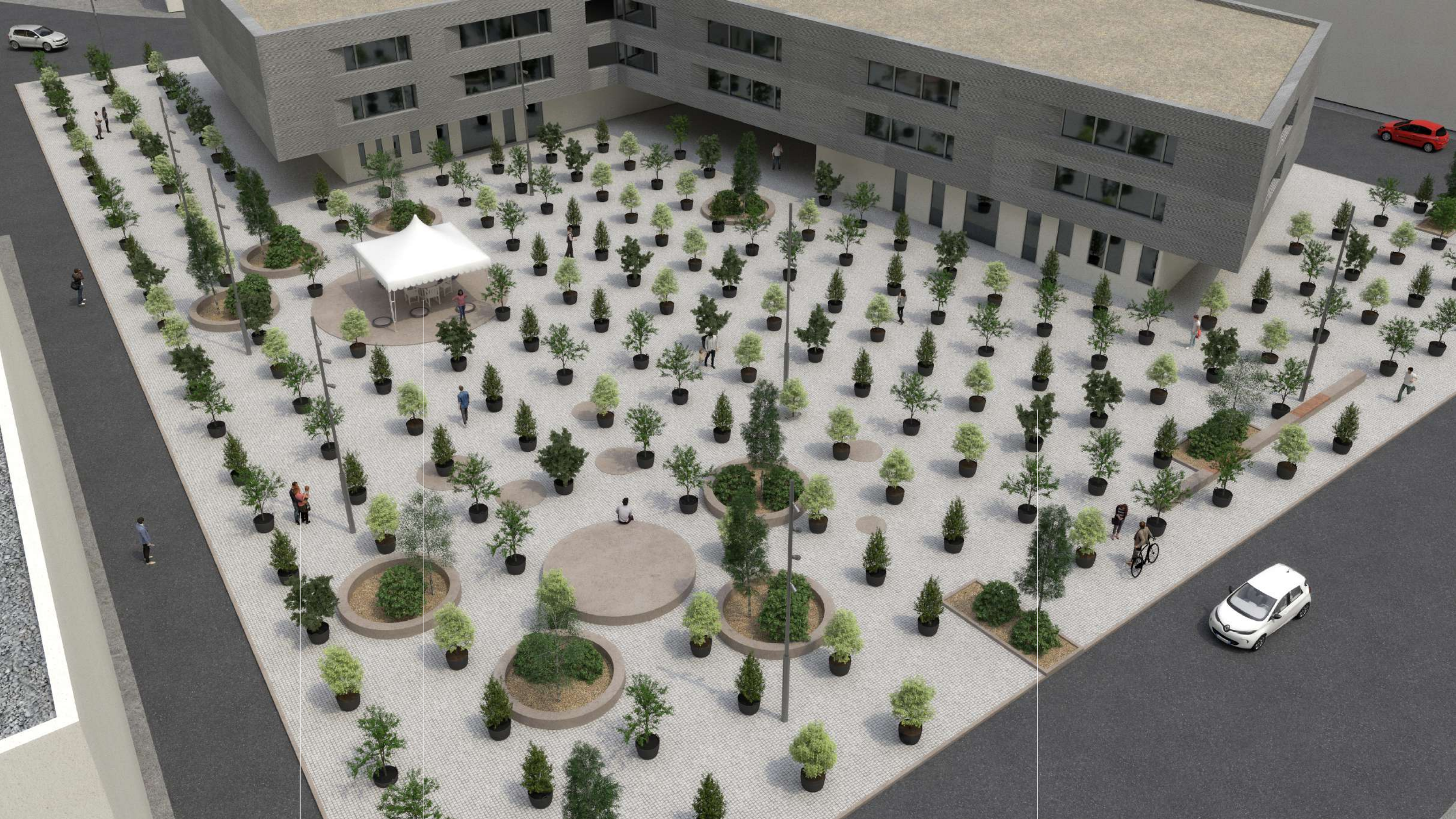
One of the 214 "adoptive" families