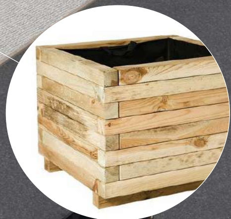
Wooden planters painted in a gradient of blue