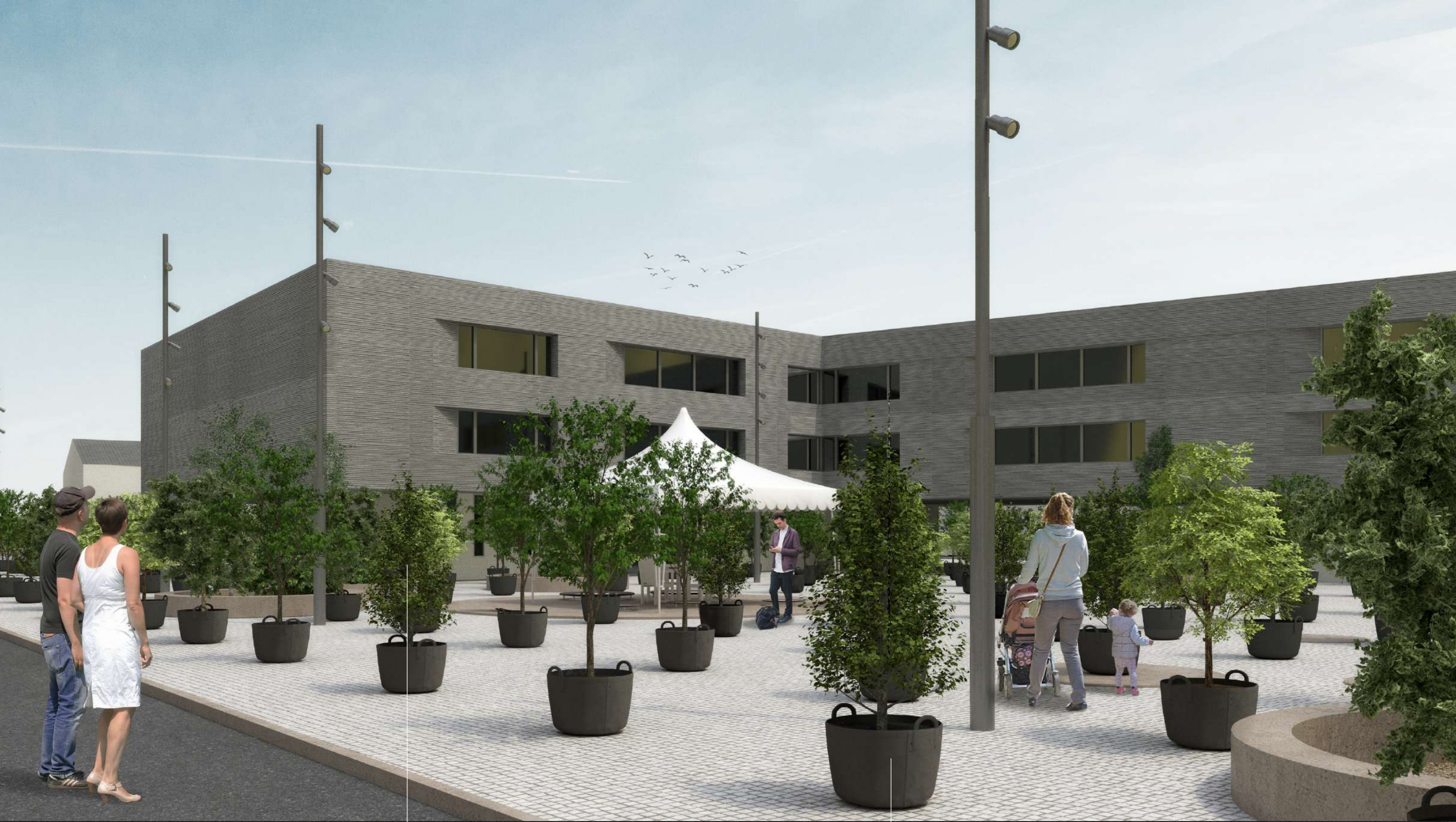
Various species of Cotinus coggygria (Wig tree), Quercus ilex (Holm oak) and fruit trees (apple trees, pear trees, etc. ....)