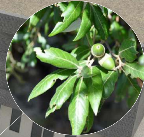
Quercus ilex (Holm oak)